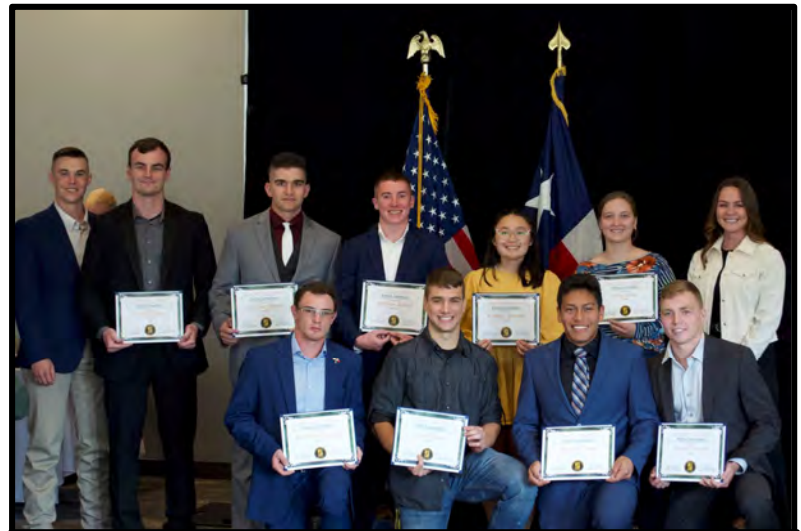
MSI Cadets receiving Perfect Attendance Awards for their dedication.