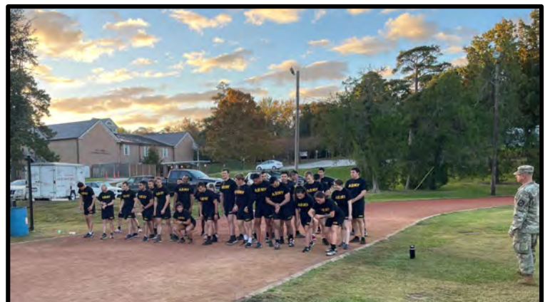
Cadets at the start line of the 2-mile run, the last event for the ACFT.