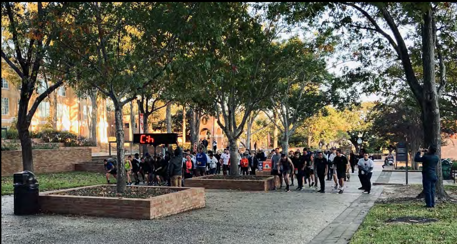
Runners awaiting the sound of the cannon to officially start the 4 th Annual CPT Rowdy Inman 5K. (Nov 13 th )