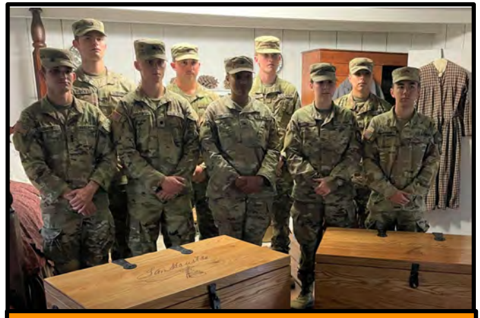
Cadets continuing the tradition of guarding the SHSU Graduation Rings.