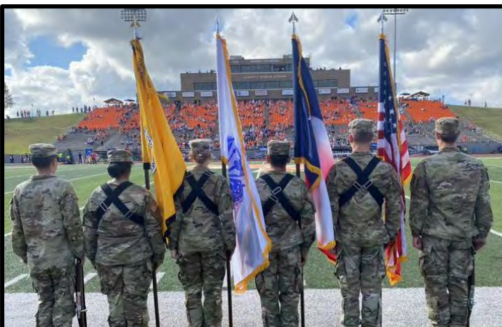
Color Guard performing as SHSU goes into the playoffs.