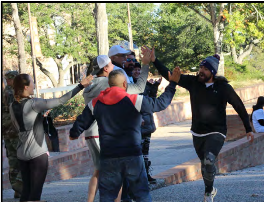
Runners celebrating together as they cross the finish line.