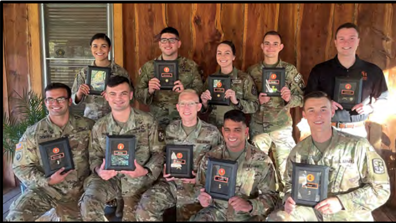
MSIV Cadets receiving their Active-Duty Branches.